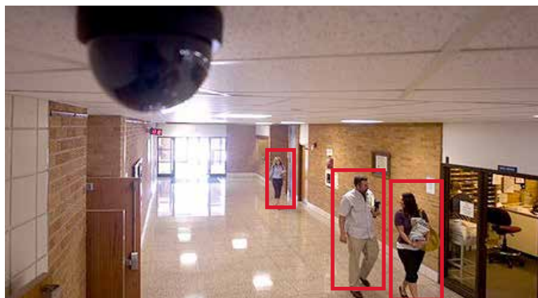
Figure 1: Indexing attributes of people in public areas.

The broad capabilities of Intelligent Video Analytics fully complement and enhance an existing security infrastructure to provide defense against, as well as proactive understanding of, security vulnerabilities. These capabilities can easily be used in many industries and business environments.